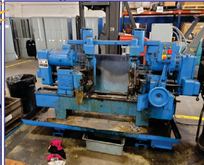
Hey No. 3 Automatic Facing & Centering Machine