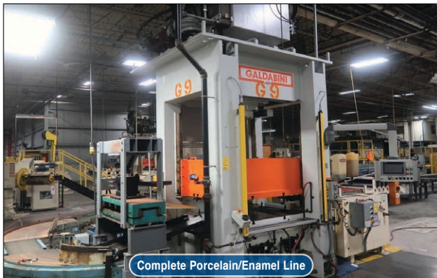
Complete Porcelain/Enamel Line

ASSET LOCATION: 2009 Mirro Drive, Manitowoc, WI 54220