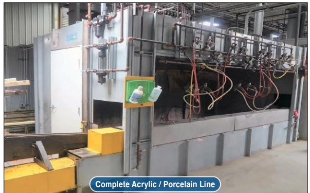
Complete Acrylic / Porcelain Line