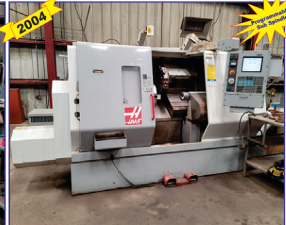
Haas TL-25B CNC Lathe w/ Sub Spindle