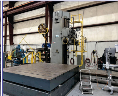
6" G&L Floor Type HBM