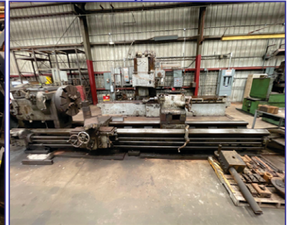
52" x 156" LeBlond Engine Lathe