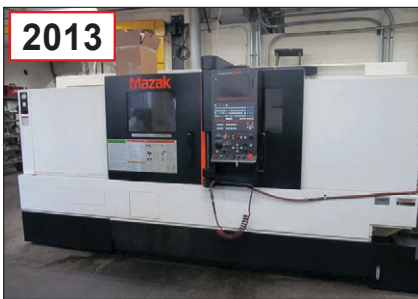
Mazak Quick Turn Smart 300 CNC Turning Center