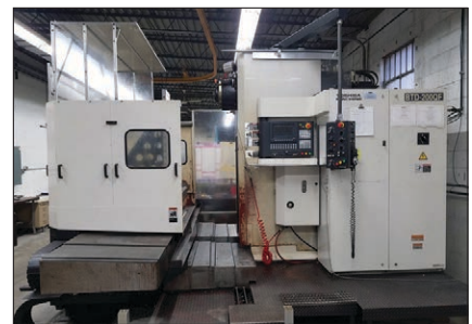
Toshiba Shibaura BTD-200QF CNC Horizontal Boring Mill