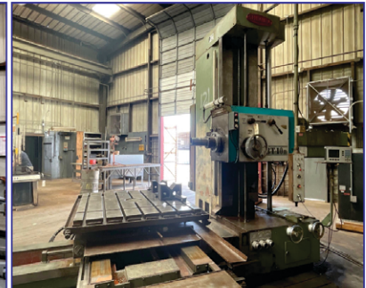
Shibaura BT-10B Table Type HBM