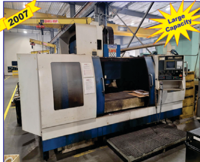
Femco VMC15800 CNC VMC

Featured Machines and Equipment: 2007 Femco VMC15800 CNC VMC, Fadal VMC4020 CNC VMC, Fadal VMC6030 CNC VMC, Haas TL-25B CNC Lathe (with Programmable Sub Spindle), Okuma MC-4VAE CNC Vertical Mill, Cincinnati Milacron 10VC-1000 CNC Vertical Mill, 6" G&L Floor Type HBM, Shibaura BT-10B Table Type HBM, VWF Table Type HBM, Hyd-Mech M-20A Horizontal Bandsaw, Marvel Series 8 MK 1 Vertical Bandsaw, Rockwell Model 20 Vertical Bandsaw, Mori Seiki, Monarch and LeBlond Engine Lathes, Schiess VBM, Bridgeport Mills, Toyota Forklift, Radial Arm Drills, Tooling, QA/QC, Sterling Semi w/ Trailer, Ford 335 Front End Loader, and More!