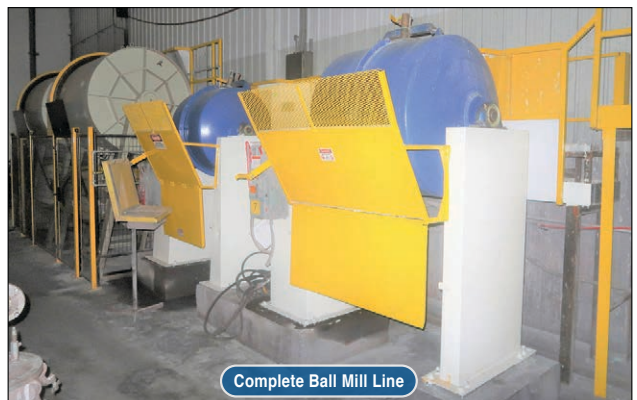
Complete Ball Mill Line

VISIT WEBSITE AND BIDSPOTTER FOR COMPLETE SPECS, THE AUCTION IS UP: BidSpotter