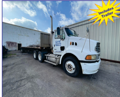
Sterling Truck with 45' Ryder Trailer