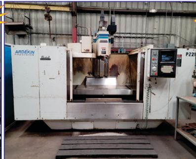
Fadal VMC6030 CNC VMC