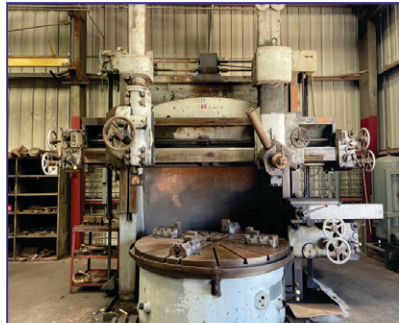
78" Schiess VBM