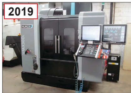
Hurco VMX30Di CNC Vertical Machining Center